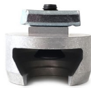
P/N 137 (hang from Unistrut)