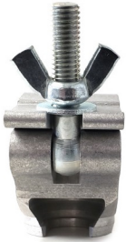
P/N 138 (hang from pipe)