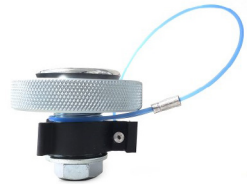
P/N 135 (attaches to fixture)

Thank you for purchasing the most flexible system available for mounting your moving lights, video, or sound equipment.